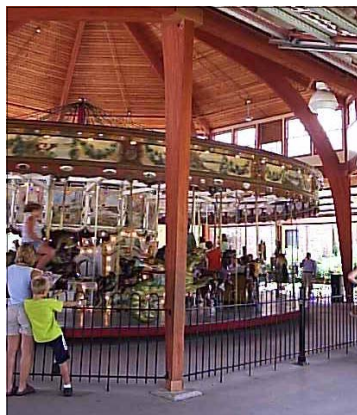
Carousel at Greenfield Village

It was a heartwarming experience to see foster children visit with former foster parents, as well as seeing them reunite with their own birth-siblings who have been placed in other homes. We hope this will become a tradition every year!