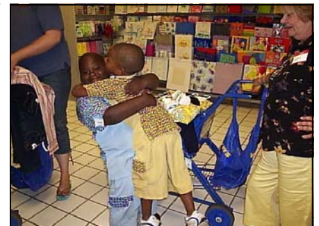
Joyful shoppers in the check-out line!

Mervyns went above and beyond when they offered ChildSpree on a day that included additional sale prices and discounts, and gave each child a brand-new backpack filled with school supplies.